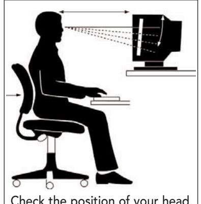
Check the position of your head, wrists, and knees.

Are you gripping too hard? Your pen, mouse, or tools should be modified to